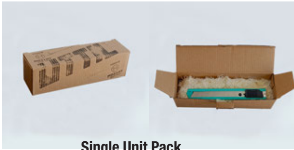
Single Unit Pack